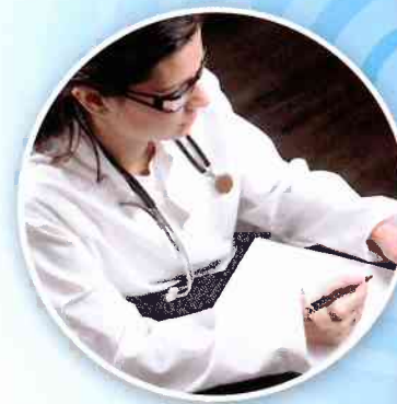
HIM Services Malignant neoplasm of breast (female) unspecified site “174.9, C50.919”