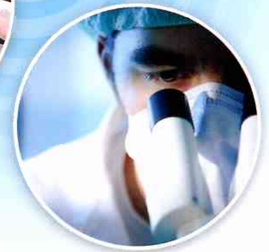
Researcher Malignant tumor of breast (Disorder) SNOMED® 254837009, 372137005